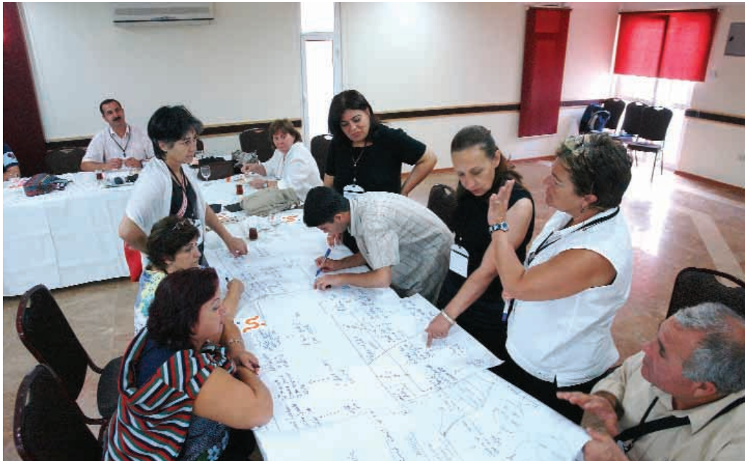
A training held by the Civil Society Development Centre at Muğla.

Apart from the CSD grant schemes, in 2006, another programme called, "The Promotion of Cultural Rights in Turkey" was launched with a budget of €2.5 million. The programme aims to support the Turkish Government in implementing legislative reforms in the field of cultural rights. The programme has two components: cultural initiatives and broadcasting in languages and dialects traditionally