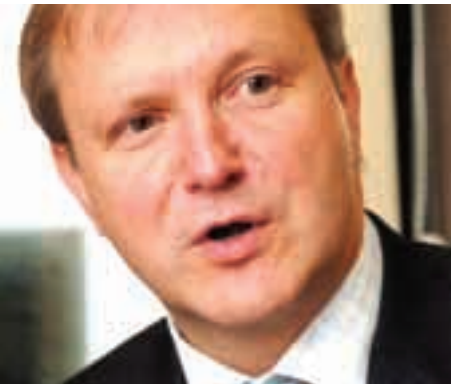
Commissioner for Enlargement Olli Rehn.

With 27 Member States and a population of close on 500 million, today's European Union is much stronger and more influential than the EEC 50 years ago when there were only 6 Member States and a population of less than 200 million.