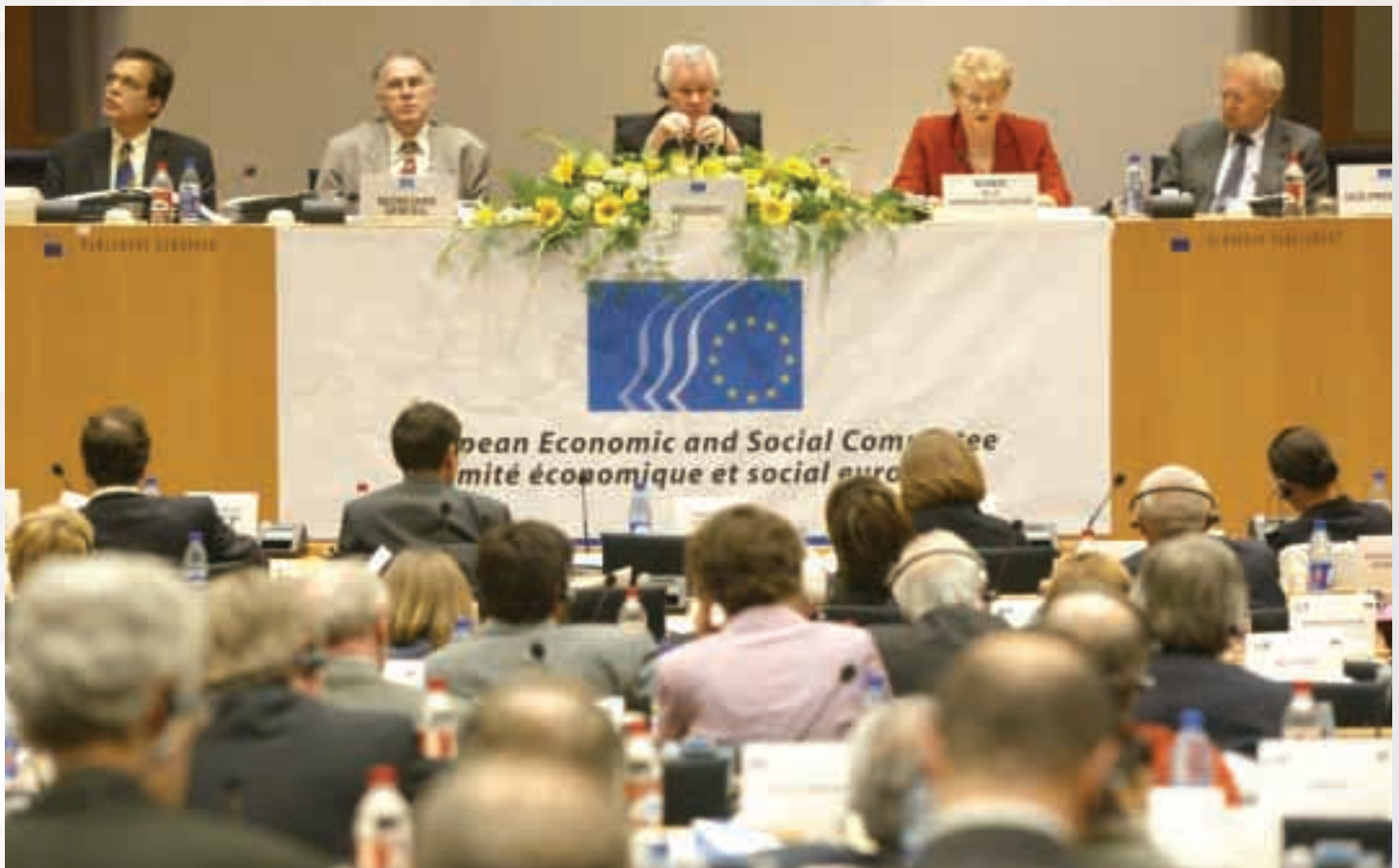
Established in 1957, the EESC has a role to play in the Union’s decision-making process. For more information, visit: www.eesc.europa.eu