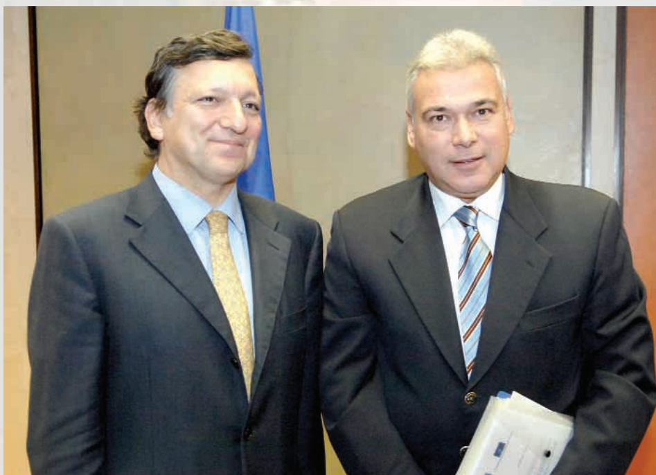
European Commission President José Manuel Barroso and EESC President Dimitris Dimitriadis.

warded to the EU's decision-making bodies and then published in the EU's Official Journal.