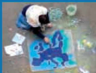
Enlargement: together we are strong