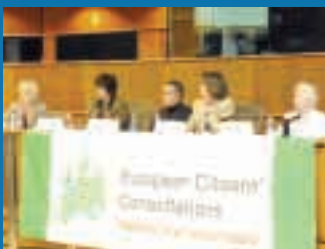
Civil Society: the missing link in EU accession talks?