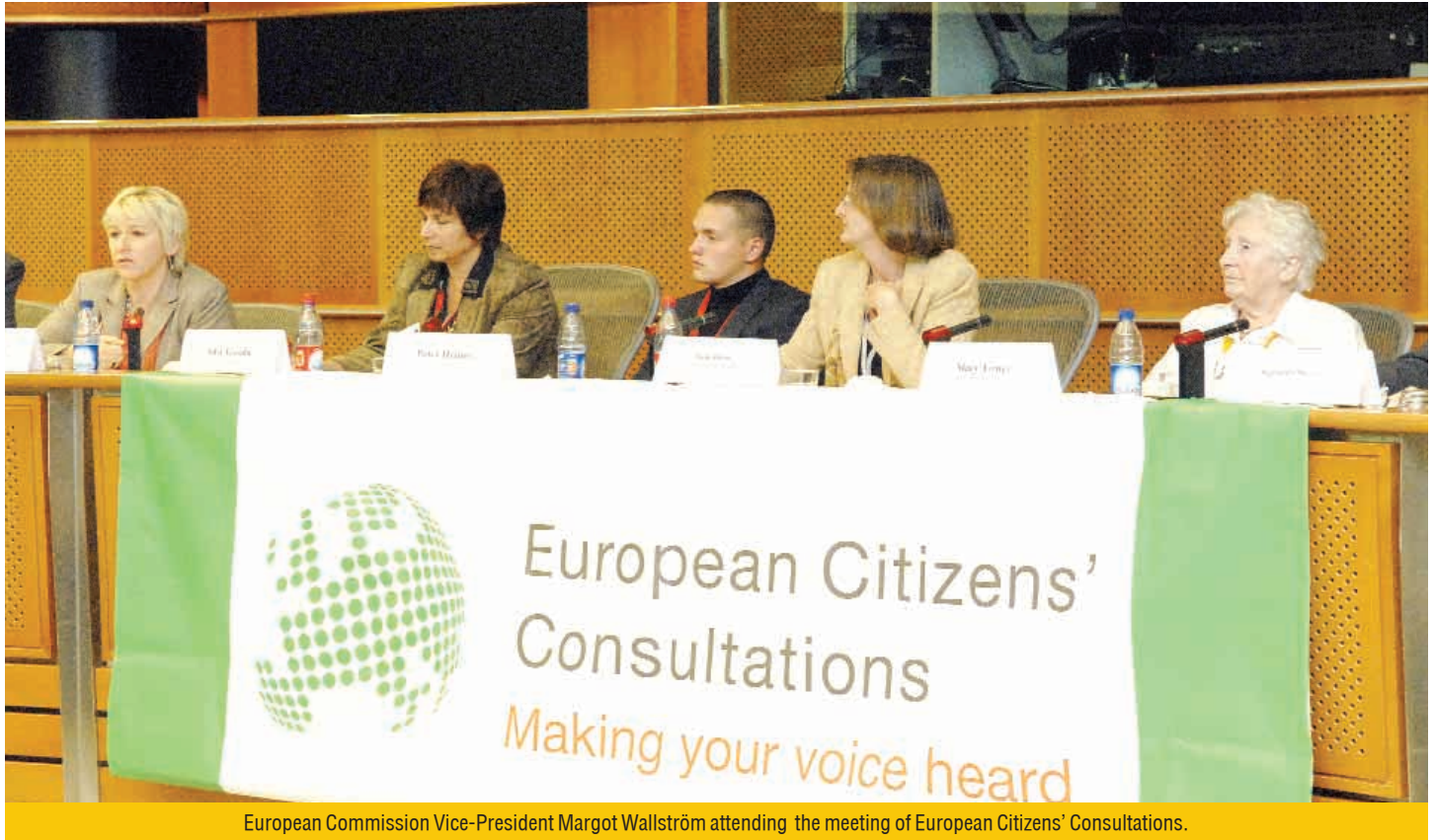
European Commission Vice-President Margot Wallström attending the meeting of European Citizens' Consultations.